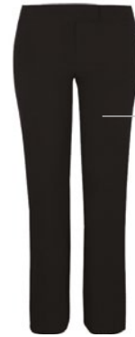
Full length, plain black conventional trousers