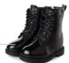
Trainer style shoes/Boots