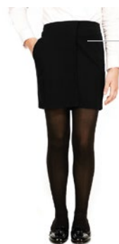
Short, tight skirts